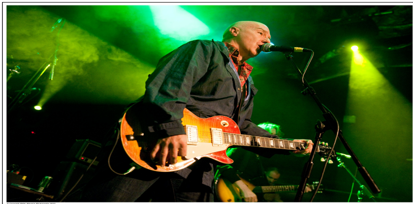
Midge Ure (Above) Mick Jones (Below)

guitar/vocals , Glen Matlock bass/vocals. The band were well greeted by the now packed crowd and they went through nearly the entire Rich Kids discography –Burning Sounds , Marching Men, Ghosts of Princess in Towers, Rich Kids etc. Midge Ure was in good humour and came across as a decent bloke. The set was tight and well delivered although there was the usual annoying gaps between songs. Gary Kemp came on stage and played guitar for the last 5 songs. He seemed to have a manic grin painted on his face and paraded around like the village idiot, although to be honest he was a decent guitar player. The Rich Kids were never a punk band and delivered a blend of power pop much influenced by bands such as The Small Faces etc. Everyone climbed onstage to do `All or Nothing ` and they finished with playing `Rich Kids` for the second time. Midge Ure was the highlight of the night, not a great deal was said about Steve New `s battle with cancer although he was mentioned a few times. I guess the money from tonight will go towards his medical bills, of course, we should wish him all the best for the future. We trundled off back outside to a London paved with snow and ice & struggled home on Britain`s decrepit transport system.