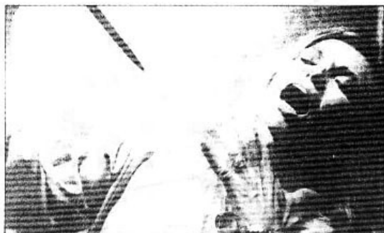
← Lucio Fulci's New York Ripper