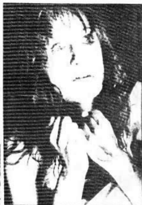
Daria Nicolodi in Tenebrae →