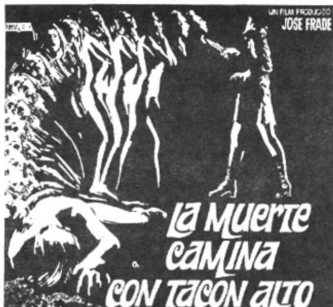
Luciano Ercoli's Death Walks in High Heels (see page 16)