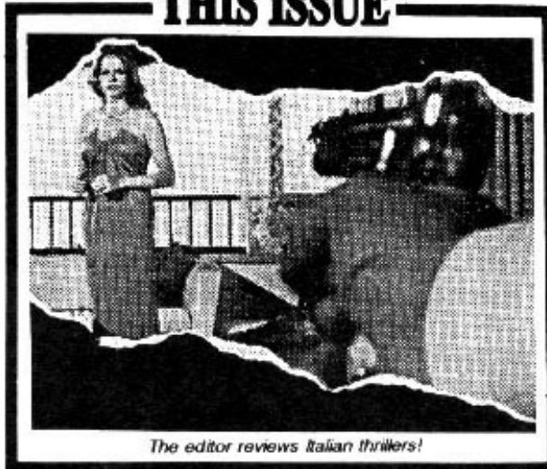
The editor reviews Italian thrillers!