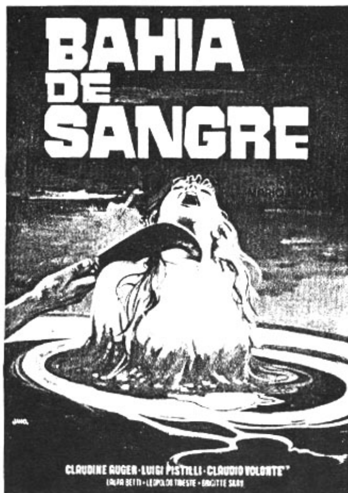
Mario Bava's Bay Of Blood [ Twitch Of The Death Nerve ] see page 10

The killer turns out to be a priest (boy, religion sure takes it on the chin in these films!) out for revenge. The print I saw was in Italian so I'm fuzzy