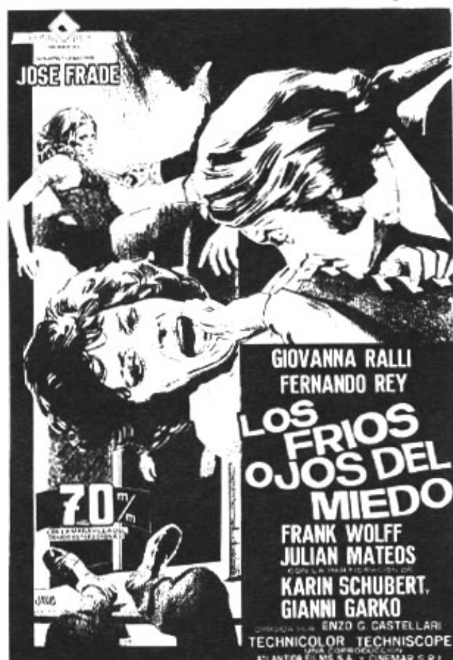
Euro ad mat for Enzo Castellari's Cold Eyes Of Fear

porno films) has a great cameo scene that features her two best attributes. Gianni Garko is ineffective as the film's nominal hero. He was much more at home in Westerns where he starred as the Sartana character. The dubbing is really obtrusive as the entire cast are given poorly done British accents. Director Castellari has no feel for the Giallo genre.