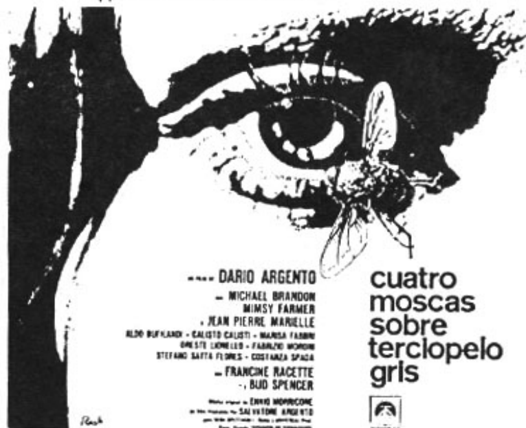
Dario Argento's Four Flies On Grey Velvet (see page 17)

Look for a cameo by Al Cliver as a police voice specialist and Fulci as Phil, an agent friend of Karlatos.