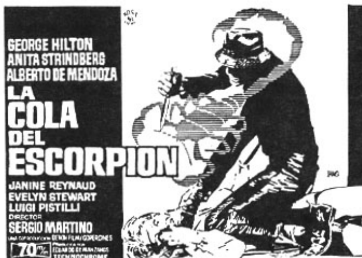
Euro ad-mat for Sergio Martino's Tail Of The Scorpion

Comments: If I had access to an English language print of this film, I can almost assure you the rating would be 4 stars. In a sly nod to PSYCHO , Sergio Martino knocks off would be heroine Evelyn Stewart a quarter of the way into the film. Anita Strindberg enters and spends the balance of the film trying to figure out who is attempting to have her join Stewart's fate (remember, George Hilton is in the cast!). Janine Reynaud and Luis Barboo (two veterans of Jesus Franco films) are a deadly duo who turn out to be red herrings. The title comes from the elaborate super-hero like clothing worn by the killer.